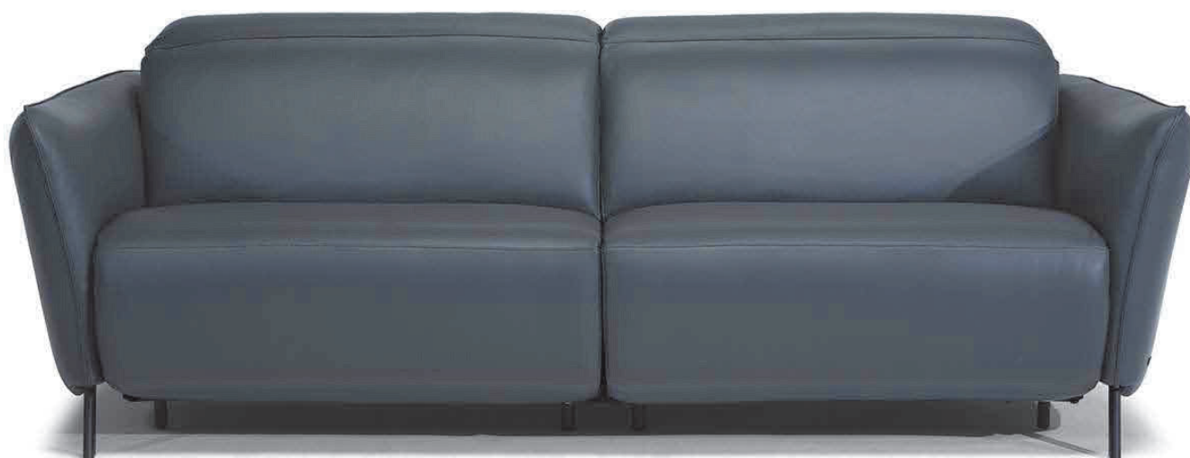
■ Vers. F46