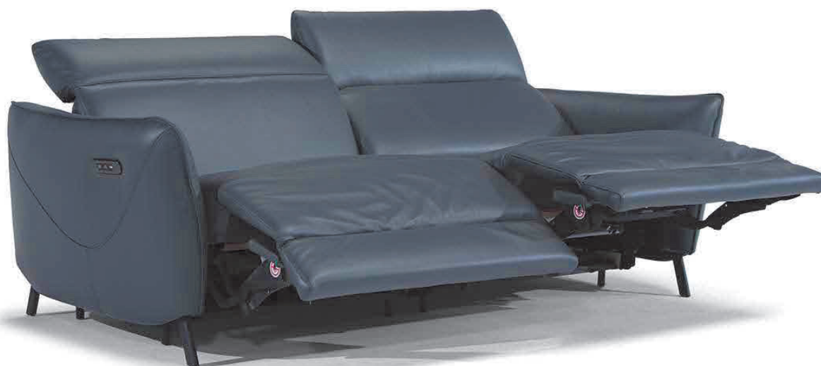
■ Vers. F46