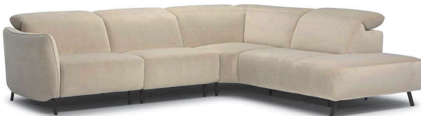
■ Vers. 272+291+481